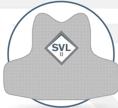
SHOWN IN DELTA CUT