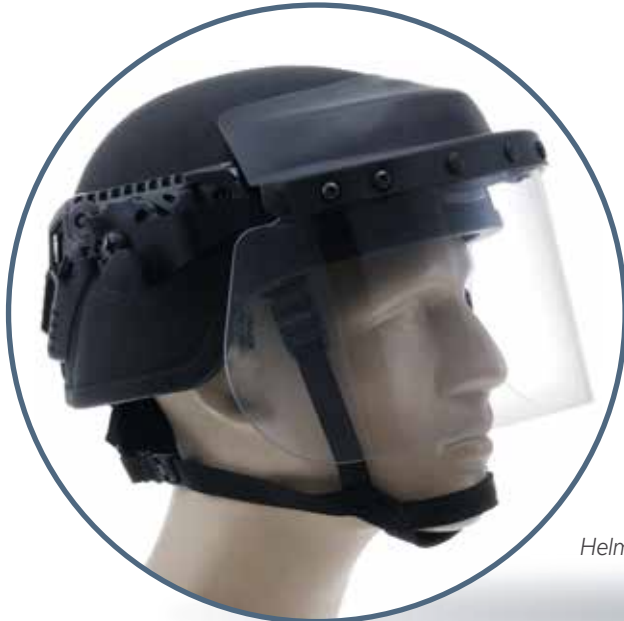
SHIELD IN DEPLOYED POSITION