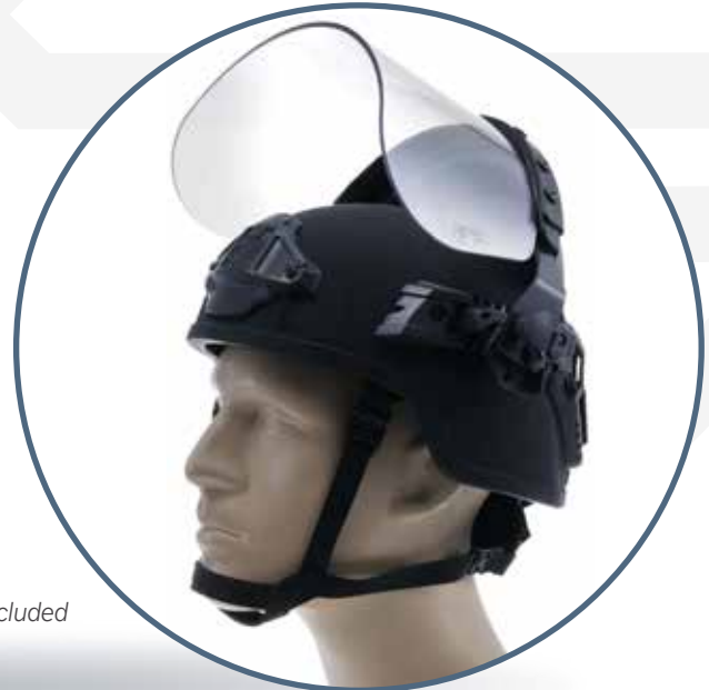
SHIELD IN STOWED POSITION