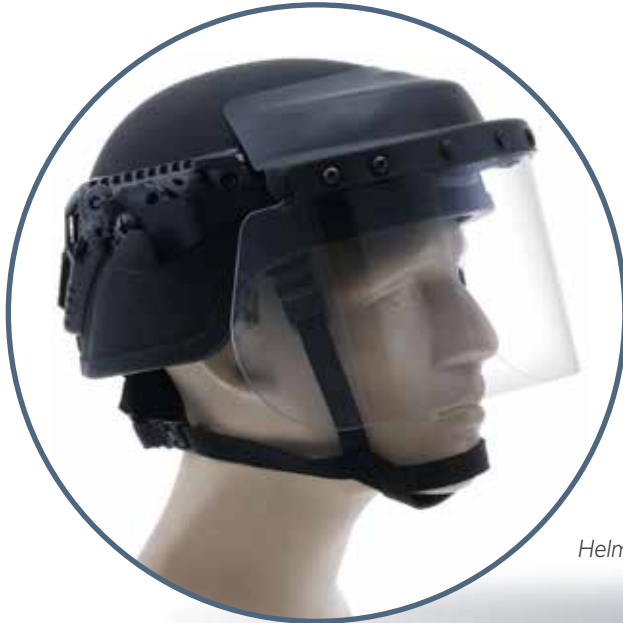
SHIELD IN DEPLOYED POSITION