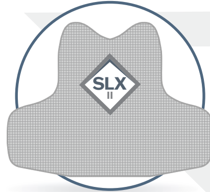
SHOWN IN DELTA CUT