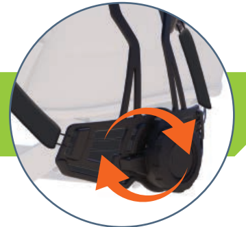
MICRO ADJUSTMENT DIAL FOR THE PERFECT FIT