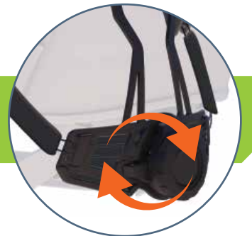
MICRO ADJUSTMENT DIAL FOR THE PERFECT FIT