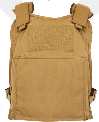
FRONT NO CUMMERBUND