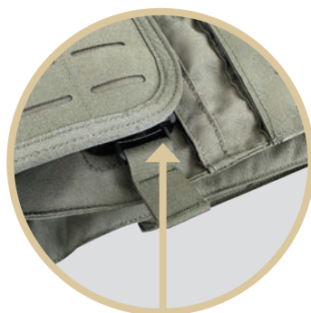
QUICKLOC SIDE ATTACHMENT SYSTEM