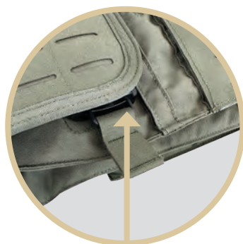
QUICKLOC SIDE ATTACHMENT SYSTEM