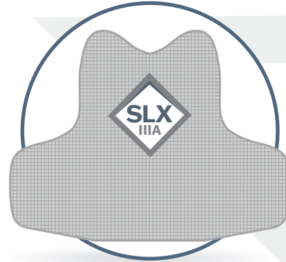
SHOWN IN DELTA CUT