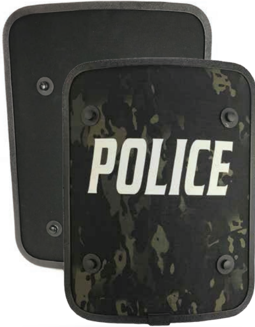
Standard PDS Shield w/ COREBOND™ ID