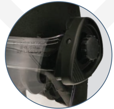
PIVOT AND LOCK ASSEMBLY